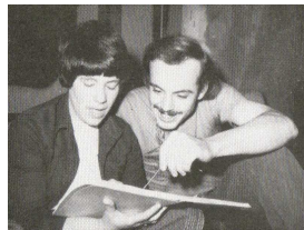
The Prisoner of 2nd Ave. - 1977