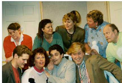
Rumors - 1993