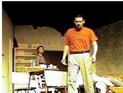
I'll Be Back Before Midnight - 2001